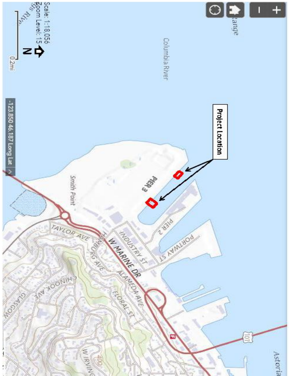
FIGURE 1: USGS Topographic Map

Maps and Drawings for Removal/Fill Permit No. 65501-RF